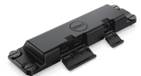
EXTENDED I/O MODULE

Read 1D or 2D barcodes and magnetic stripe cards with the Scanner Module that attaches securely to the back of your rugged tablet.