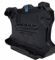
GAMBER-JOHNSON VEHICLE DOCK

Easy to use auto-latch mechanism ensures tablet is latched simply by placing the tablet in the dock. Designed for easy access to the tablet's optional on-board I/O module ports and tethered stylus.