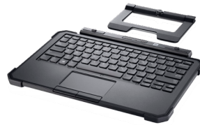
KEYBOARD WITH KICKSTAND

Maximize productivity with an IP-65 rated dock for rugged environments. Featuring dual-display support with VGA, Serial and Display Port outputs, and dual spare battery charging slots.