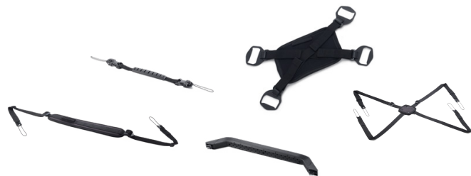
RUGGED TABLET CARRYING ACCESSORIES

Take your rugged tablet anywhere in the field, with lightweight and flexible shoulder straps, durable nylon and rigid handles, and easy-to-use cross-straps and chest-straps.