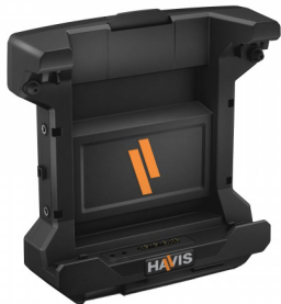
HAVIS VEHICLE DOCK

Outfit your entire fleet of vehicles with a single docking solution for your rugged tablet. A low profile design maximizes available space inside of vehicle.