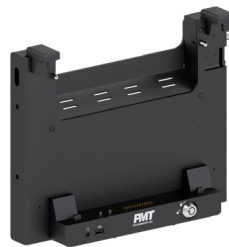
PMT VEHICLE DOCK

Outfit your entire fleet of vehicles with a single docking solution for your rugged tablet. A low profile design maximizes available space inside of vehicle.