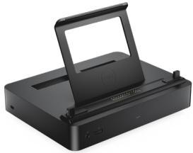
RUGGED TABLET DOCK

Maximize productivity with an IP-65 rated dock for rugged environments. Featuring dual-display support with VGA, Serial and Display Port outputs, and dual spare battery charging slots.