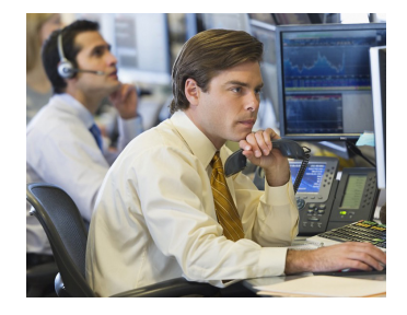
Organizations with mixed environments and combination of on site and remote workers