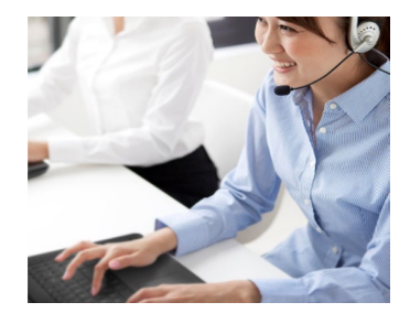
Organizations with high deployment needs with multiple offices and remote workers