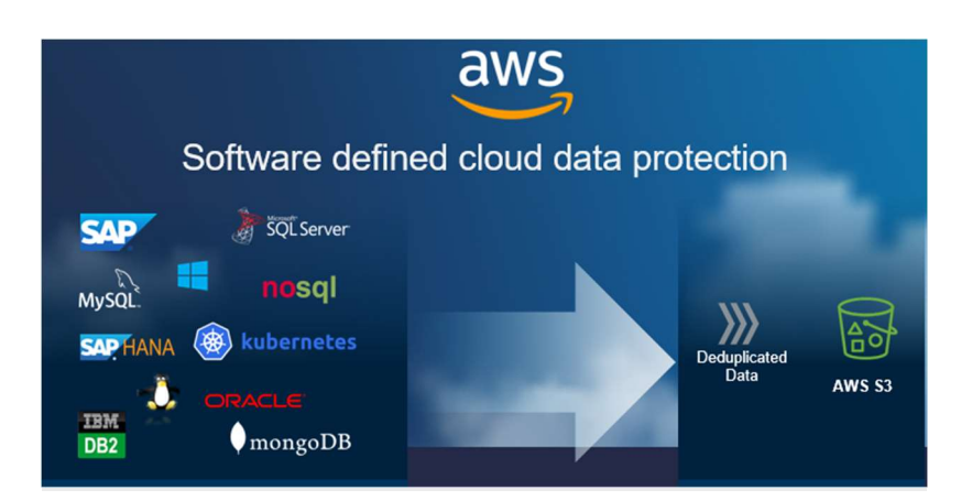
Multicloud data protection for AWS

Dell cloud data protection solutions help drive operational efficiency, resiliency and scalability while reducing the total cost of ownership with up to 77% more cost-effective cloud data protection in AWS than the competition.<sup>1</sup>