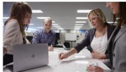
Continuum of Vscale professional services