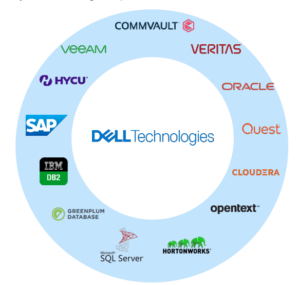
Figure 2. DD Boost delivers advanced integration with a broad ecosystem of backup software and applications.

as well as the flexibility to seamlessly plug Data Domain into your existing on-premises environments.