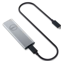
DELL PORTABLE SSD, USB-C 250GB

Protect your notebook and accessories with this lightweight backpack that is made with shock-absorbing EVA foam and Dell's EcoLoop™ solution dyeing process.