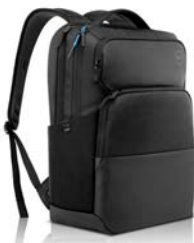
DELL PRO BACKPACK 17 | PO1720P

Experience realistic images like never before on the award-winning, world's first 31.5" 8K monitor featuring Dell PremierColor.