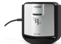
X-RITE COLORIMETER 1 DISPLAY PRO The iDisplay Pro ensures a perfectly calibrated and profiled display while delivering the speed, options and flexibility needed to maintain color accuracy.

*Based on Dell internal testing using included cable and connected to Dell PCs supporting USB 3.1 Gen 2.