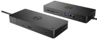
PRECISION THUNDERBOLT DOCK | WD19TB

SMART SOLUTIONS TO HELP YOU WORK MORE EFFECTIVELY.