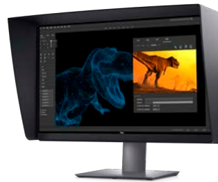
DELL ULTRASHARP 27 4K PREMIERCOLOR MONITOR WITH A HOOD | UP2720Q

3Dconnexion's patented 6-Degrees-of-Freedom (6DoF) sensor is specifically designed to manipulate digital content or camera positions in the industry-leading CAD applications. Simply push, pull, twist or tilt the 3Dconnexion controller cap to intuitively pan, zoom and rotate your 3D drawing.