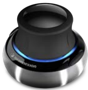
3DCONNEXION SPACEMOUSE WIRELESS

Multi-task seamlessly across 3 devices with this premium full size keyboard and sculpted mouse combo with programmable shortcuts and 36 months battery life.