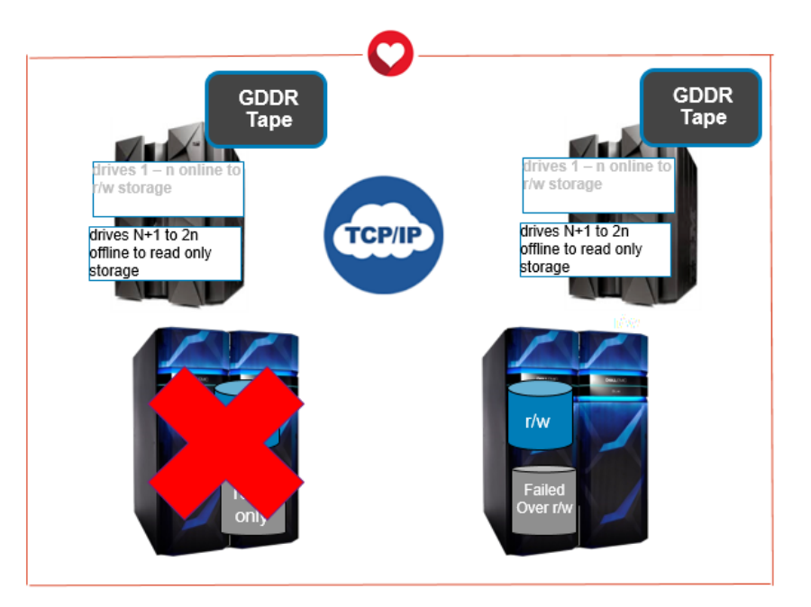
Figure 3. Use of GDDR Tape to automate failover of sites

Dell EMC replication software enables network-efficient replication to one or more disaster recovery sites. Data can be encrypted in-flight when being replicated between Data Domain systems.