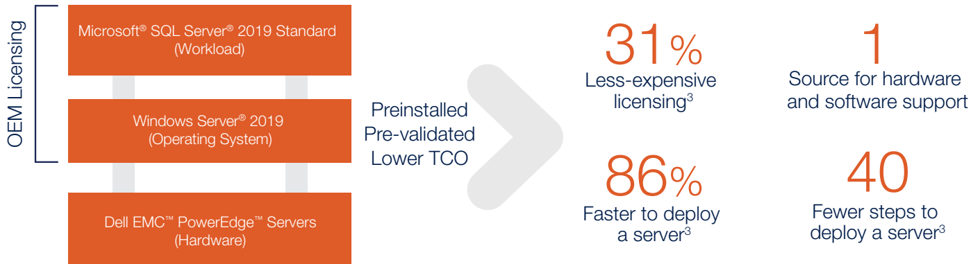
Figure 1. To reduce TCO, you can purchase Dell EMC™ PowerEdge™ servers bundled with OEM-licensed versions of Windows Server® 2019 and Microsoft® SQL Server® 2019 Standard

Dell Technologies provides just such an upgrade path by offering Dell EMC™ PowerEdge™ servers together with all Windows Server® 2019 and SQL Server 2019 OEM licensing. This offer of hardware bundled with software, together with Dell Technologies' no-cost pre-sales sizing tool, Live Optics ( www.liveoptics.com ), makes deploying SQL Server easy. And Dell Technologies' combination of one-stop technical support, rich tools for smart management, and multi-layer security helps contribute to a simple and dependable solution with low total cost of ownership (TCO).