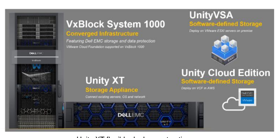
Unity XT flexible deployment options