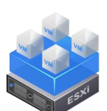
UnityVSA software-defined storage on VMware

An agile software-defined virtual storage appliance that costs nothing to