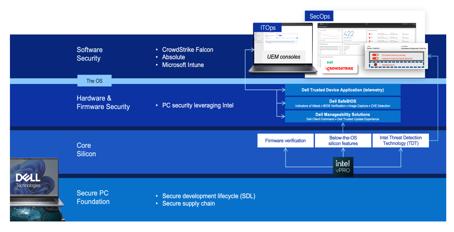
Figure 2. Tighten the 'IT-Security Gap' with hardware and software defenses that work together

As illustrated in Figure 2, CrowdStrike Falcon XDR/EDR can leverage devicelevel telemetry from Dell commercial PCs running on Intel vPro, as well as Intel TDT to detect the stealthiest attacks.