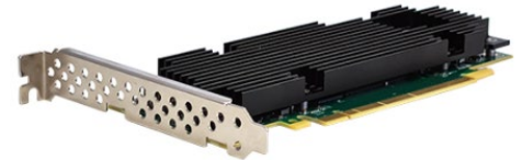
Silicom Lisbon ACC100 Card

The demanding Open RAN physical layer processing required by 5G necessitates an outboard PCIe hardware accelerator card. Dell Technologies plans to leverage Silicom's Lisbon ACC100 Forward Error Correction (FEC) card. Silicom's eASIC ACC100 FEC Accelerator server adapter is based on the Intel vRAN Dedicated Accelerator ACC100.