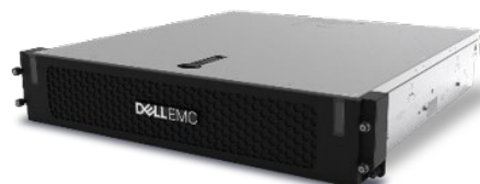
Dell EMC PowerEdge XR12 Server