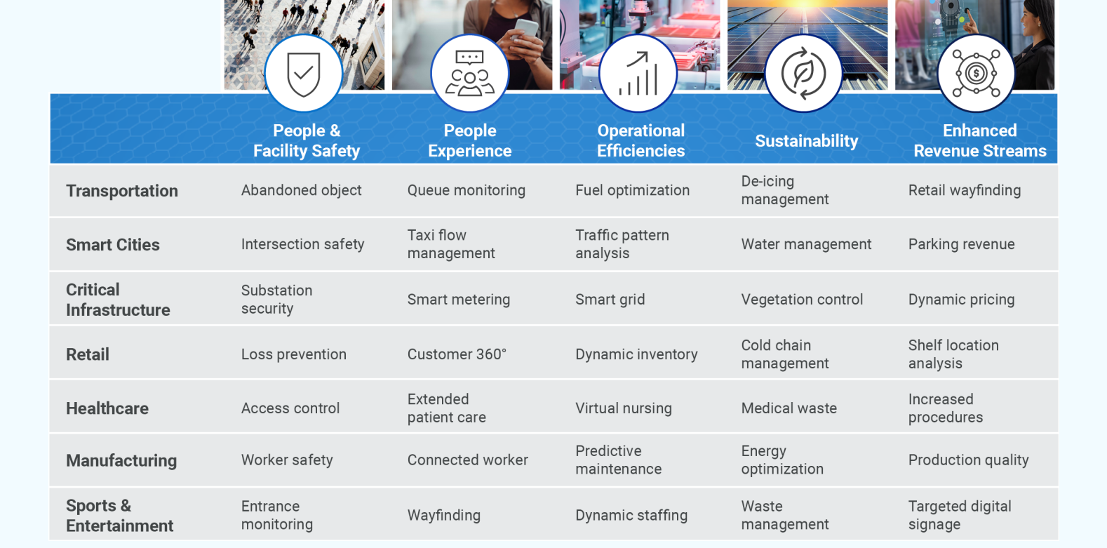
Table 1. Computer vision example workflows: Delivering greater business value by focusing on the right outcomes.

Once the desired outcome(s) are identified, the Dell Technologies team supports customers through their data journey and works with key customer stakeholders to define the specific workflows that will achieve the desired outcomes.