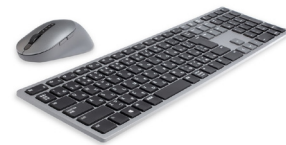
Dell Premier Multi-Device Wireless Keyboard and Mouse - KM7321W

Elevate your productivity on this innovative 27-inch QHD Hub monitor with a wide color coverage including DCI-P3. Features ComfortView Plus an always-on built-in low blue light screen, USB-C with up to 90W power delivery, and RJ45 connectivity.