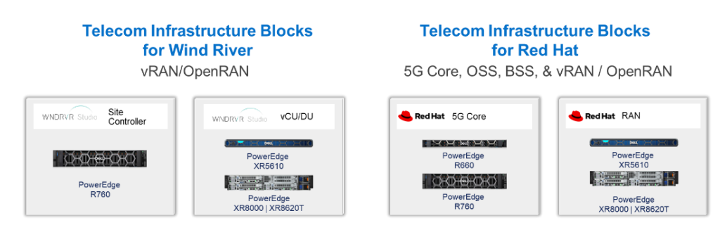
Figure 2: Certification Test Lines

To execute certification, specific Telecom Infrastructure Blocks test lines are established in OTEL. This certification program leverages OTEL's hybrid connectivity model which allows telecom partners and CSP to securely extend their lab into OTEL from anywhere on the world. Participating in certification can be completed virtually and does not require the participant to travel to conduct the certification execution. Using OTEL gives NEPs and ISVs the ability to validate their software with access to latest Dell Technologies and partner ecosystem hardware platforms. OTEL supports multi-vendor system integration at scale, cloud operations modeling, multiple test-line configurations and user-defined validation at varying scope.