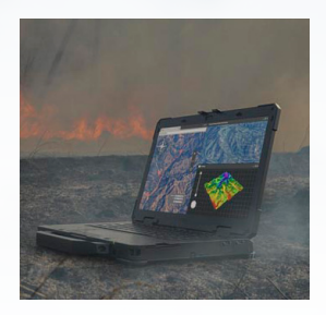
Rugged Mobility Latitude