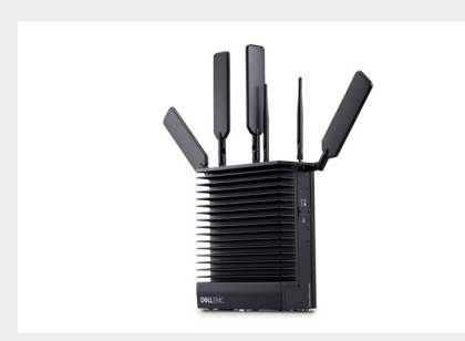
Edge Gateway 3200