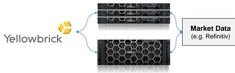
Fig.1 – Capital Markets Example

Based on a deep and persistent innovation in analytic database architecture (including hardware & software), the Yellowbrick data analytics solution enables lightning-fast insights from petabytes of data, even with hundreds of users working in parallel using common BI and data science tools. With Yellowbrick, even the most complex real-time workloads (involving years of historical data run in seconds).