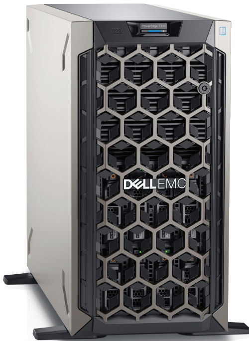
Dell EMC PowerEdge T340 Server

Dell EMC VxRail HCI, with deep VMware software integration, offers a fully curated, turnkey HCI experience for simple, consistent operations across core, edge and cloud.