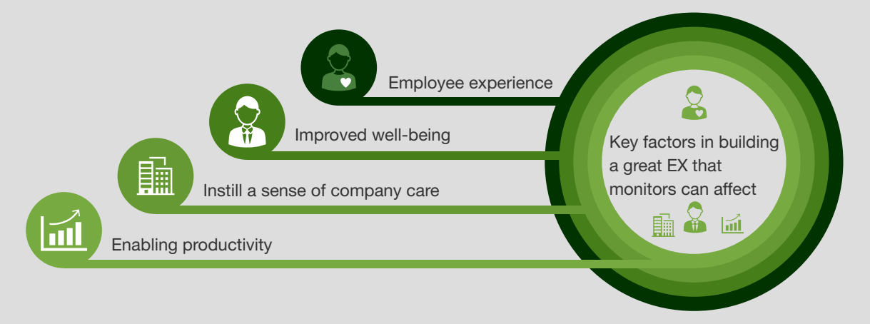
Figure 3 Factors That Impact EX

Base: 450 professionals across China, the UK, and the US