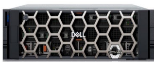
Dell PowerMax Array