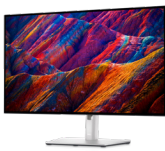
Dell UltraSharp 27 4K USB-C Hub Monitor | U2723QE

Designed, tested and certified to work seamlessly together with Dell systems. We offer full productivity and collaboration solutions as well as mounting kits and Rack Shelf for the data center.