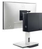
Precision All-in-One Display and Stand | CSF25

Be your most productive on a 27 inch monitor with brilliant color and contrast that features the industry's first IPS Black technology and a connectivity hub. 1