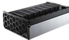
Hypershelf for Precision 3280

Elevate your video conferencing experience on this powerful, intelligent 4K webcam that optimizes your visuals with a large 4K Sony STARVIS™ CMOS sensor and AI Auto-Framing.