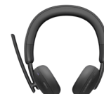
Dell Wireless Headset | WL3024

Create an unequalled 3D navigation experience with the most ergonomically designed product 3Dconnexion has ever created.