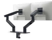
Dell Dual Monitor Arm | MDA20

Mount your Precision on the All-in-One Display and Stand to save space.