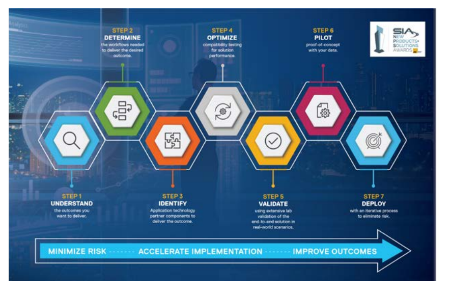
Figure 1: The Dell Technologies Validated Design Process for Computer Vision

At the start of the process, it is also important to discover what stage the customer is at in their smart space journey, and this is plotted on an analytics maturity curve. It denotes whether they are currently 'reactive' and have primarily used data for descriptive and diagnostic purposes or are 'proactive' and used it for more projective, predictive and prescriptive purposes.