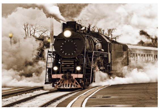
Steam-powered railways, 1784