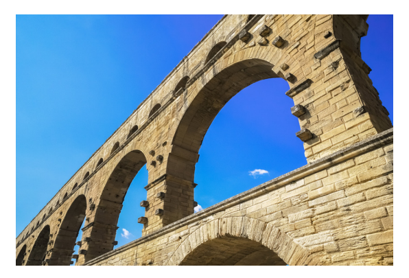
Aqueduct, 312 B.C. - A.D. 226

The definition of "infrastructure" is not static