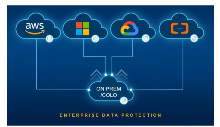
Data Domain Virtual Edition for public cloud

Maintain control and ensure data immutability with Retention Lock Governance mode in all supported cloud environments and where an even greater level of protection is required, you can choose Retention Lock Compliance in AWS, Google and Azure environments.