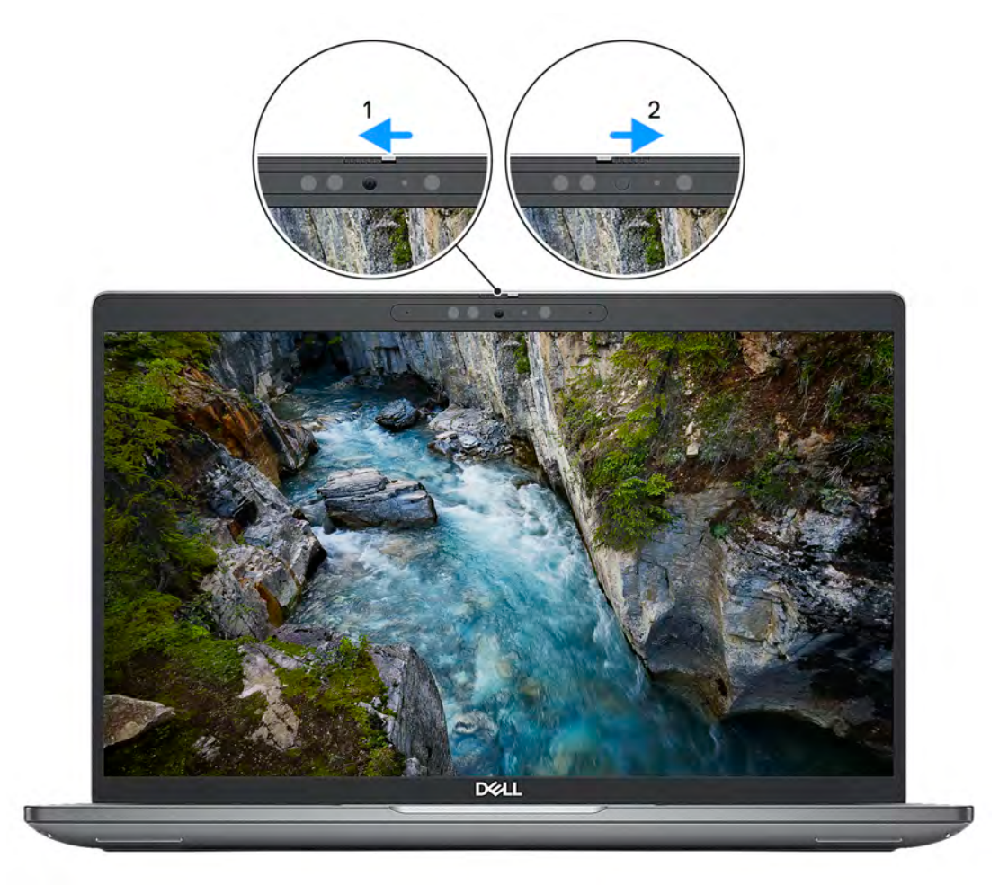
Figure 2. Camera shutter