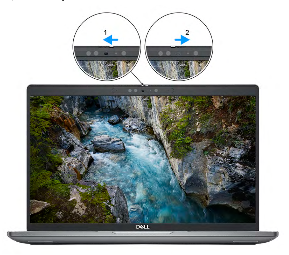
Figure 1. Camera shutter