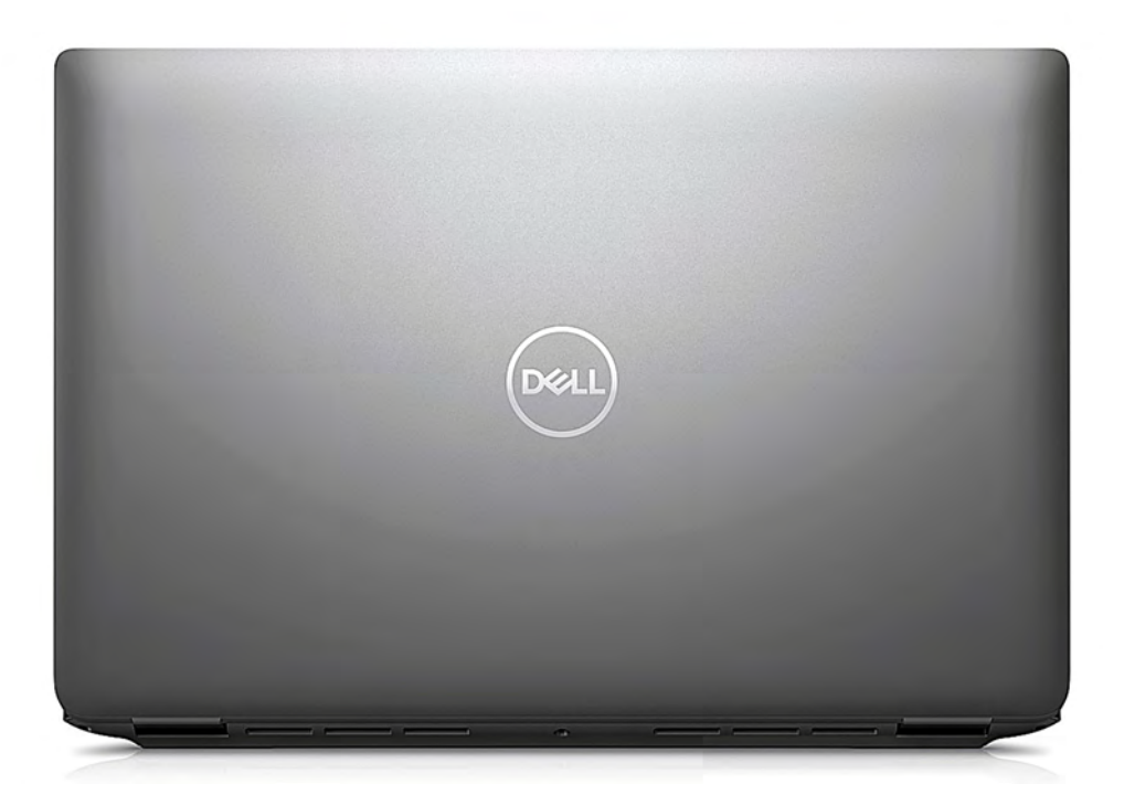
Figure 3. Color, material, and finish

This section provides the color, material, and finish (CMF) specifications of your Precision 3480.