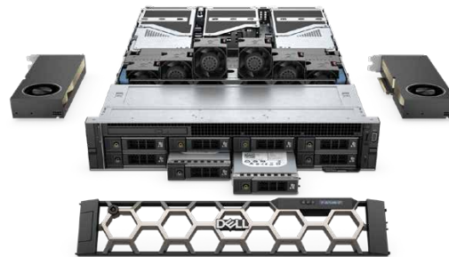
Dell Precision 7960 Rack

Intelligence and machine learning elevate productivity by automating performance features beyond your PC, across your entire ecosystem.