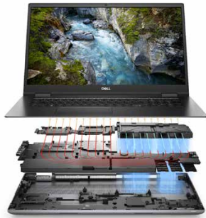
Dell Precision 7780 Workstation

Intelligence and machine learning elevate productivity by automating performance features beyond your PC, across your entire ecosystem.