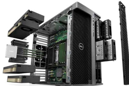
Dell Precision 7960 Tower

Be productive from almost anywhere with a powerful, secured access rack based solution that keeps your intellectual property safely in the data center.