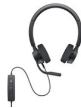
Dell Wired/Wireless Headset - WH3022

Work efficiently. Easy dual-mode connectivity offers you the option to pair and connect to almost any PC via 2.4GHz wireless or Bluetooth 5.0.