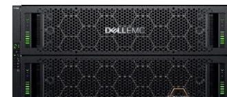
ME484 Expansion Enclosure 84 drive / 5U