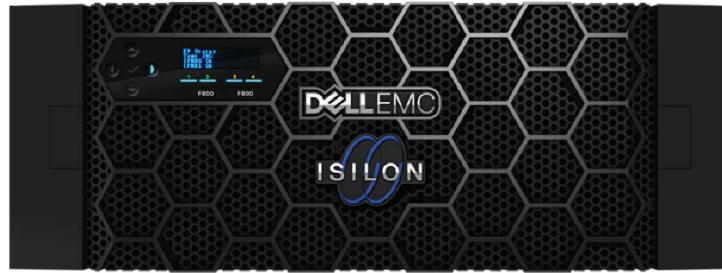
Figure 2: Isilon H400 chassis, containing four storage nodes

In the solution tested for this document, four H400 nodes, in one chassis, were used.