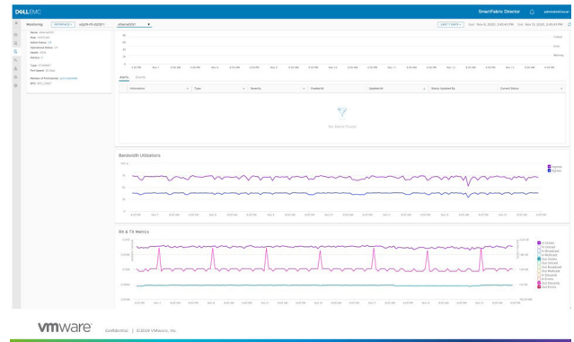
Fig 4. Time-series representation of individual metrics

SmartFabric Director supports highly scalable and flexible openconfig-based streaming telemetry to gather key operational data and statistics from the fabric switches. SmartFabric Director collects telemetry data from the switches and provides out-of-the-box insights such as switch health and fabric health that can ensure consistency between the operational state and the intended state. Comprehensive and highly intuitive visualization of the time-series data and other telemetry information greatly simplifies the day-to-day operations of the fabric. A switch profile screen includes key operational data that gives the operator a quick and easy way to monitor switch state.