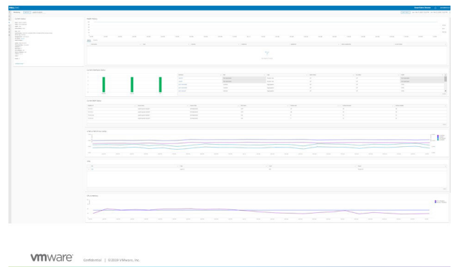
Fig 3. Switch health visibility