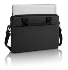
Dell Ecoloop Pro Sleeve (S) - CV5423 (13/14" models)

Travel light while making a positive impact on the environment by selecting the compact, eco-friendly Dell Premier Slim Backpack 15 (PE1520PS) with EVA foam cushioning to protect your laptop from impact.