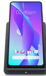
Dell Dual Dock - HD22Q

Experience industry leading video quality and picture clarity in any lighting with this intelligent 2K QHD webcam.