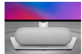
Dell Speakerphone - SP3022

Boost your PC's power up to 90W with ExpressCharge on the world's most powerful and first modular USB-C dock with a future-ready design. 16, 17