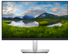
Dell 24 USB-C Hub Monitor - P2422HE

Stay productive, no matter where you work. Reduce harmful blue light with this sleek 23.8-inch FHD hub monitor with ComfortView Plus.