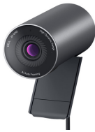
Dell Pro Webcam - WB5023

Stay productive, no matter where you work. Reduce harmful blue light with this sleek 23.8-inch FHD hub monitor with ComfortView Plus.