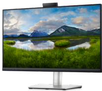
Dell 24 Video Conferencing Monitor - C2423H

Stay in sync on a 24-inch FHD monitor with built-in conferencing essentials, low blue light and an eco-friendly design.