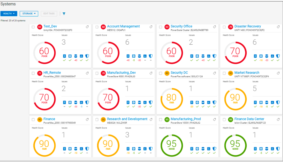
Health scores and recommendations