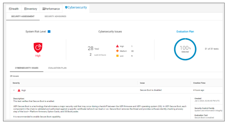
Cybersecurity assessments and recommendations