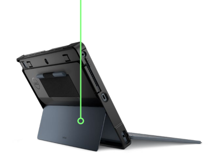
Compatible with Latitude 7350 Detachable Collaboration Keyboard

Works with kickstand of the Dell Latitude 7350 Detachable<sup>1</sup> for hands-free viewing