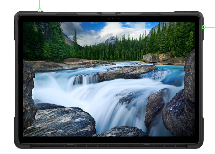
The bumper shields the vulnerable corners

High quality dual injection construction with black TPU bumpers on a black polycarbonate case, combination of both make the case absorbs any impact rather than the device