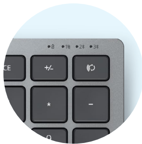
Battery and connectivity indicators