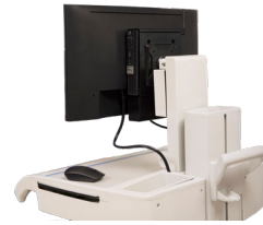
OPTIPLEX MICRO DUAL VESA MOUNT WITH ADAPTER BRACKET

This mount allows the Micro to be VESA mounted to select Dell E Series displays.