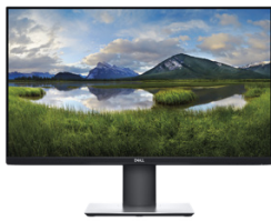
DELL 24 MONITOR - P2419H

23.8" ultrathin bezel optimized for dual display productivity. Easy Arrange feature enables multitasking efficiency and its small base frees valuable workspace.