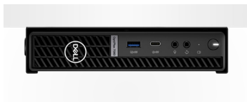
OPTIPLEX MICRO VESA MOUNT WITH ADAPTER BRACKET

Mount your system on a wall or under a surface with a VESA-compatible DVD+/-RW enclosure with full optical drive access. Includes an adapter box to securely house the system's power adapter.