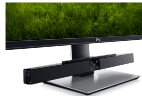
DELL PROFESSIONAL SOUND BAR - AE515M

Optimize your workspace with this efficient 21.5" monitor built with an ultrathin bezel, a small footprint and comfort-enhancing features.