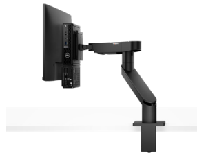
DELL SINGLE MONITOR ARM - MSA20

Mount your system on a wall or under a desk. Includes an adapter box to securely house the system's power adapter.