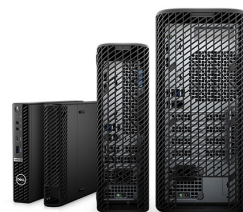
OPTIPLEX CABLE COVERS

Communicate clearly with a headset optimized to provide in-person sound quality, certified for Microsoft Skype for Business.