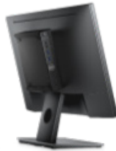
OPTIPLEX MICRO ALL-IN-ONE MOUNT FOR DELL E SERIES MONITORS

Small footprint mounting solution adapts to your environment, with cable management and monitor height adjustability, tilt, swivel and pivot functions.