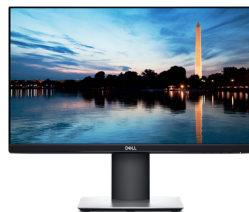
DELL 22 MONITOR - P2219H

23.8" ultrathin bezel optimized for dual display productivity. Easy Arrange feature enables multitasking efficiency and its small base frees valuable workspace.