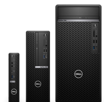
OPTIPLEX DUST FILTERS

Thermally tested custom cable covers offer an easy to install and attractive way to manage cables and secure ports.