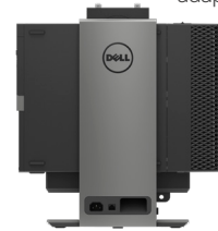
OPTIPLEX SMALL FORM FACTOR ALL-IN-ONE STAND (COMING SOON)

Minimize your footprint with this arm that offers easy installation and enhanced adjustability while keeping cables neatly hidden from view.