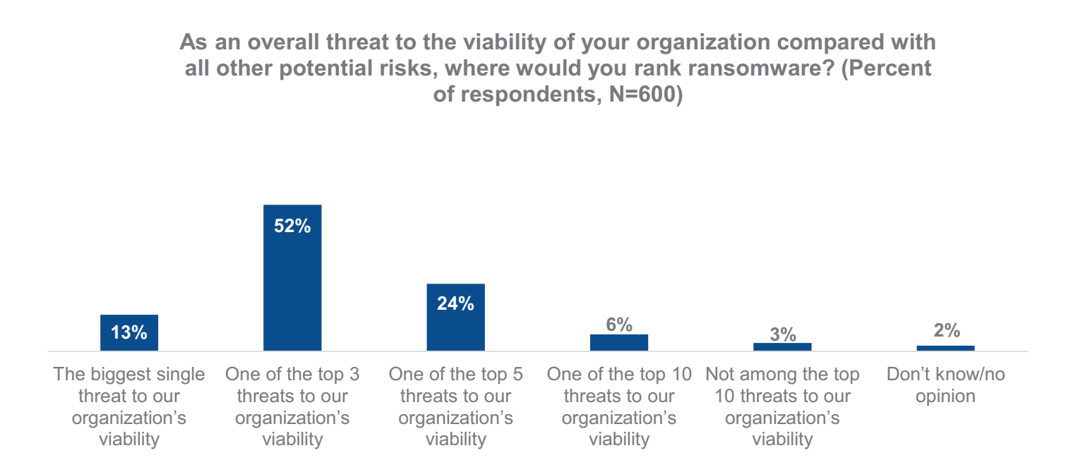
Figure 1. Ransomware Is a Top Threat to Organizations' Viability