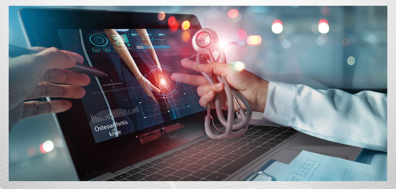
<sup>2</sup> Definitive Healthcare – 09/2022

#1 in healthcare for multiple product categories²