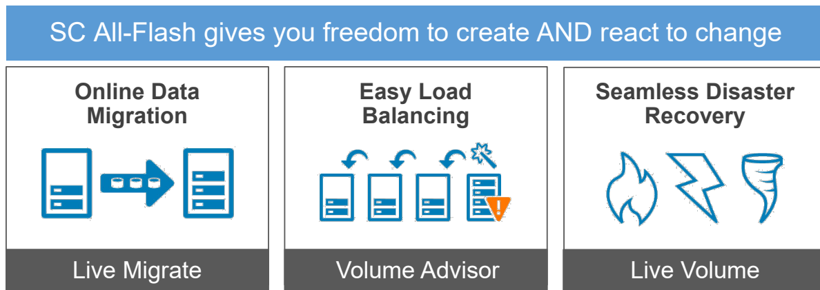
Fig. 1 – Change storage configurations quickly without impacting your workloads. Federated architecture with built-in auto-failover makes SC All-Flash the smart choice to deliver consistent value in volatile business environments.

Included Live Volume also keeps workloads running during unexpected outages and disasters. Non-disruptive auto-failover between fully-synchronized volumes on local and remote arrays protects your vital business operations with no need for extra hardware or software purchases. Live Volume helps you achieve ZERO RTO/RPO, and even auto-repairs your high-availability environment when a downed array comes back online.