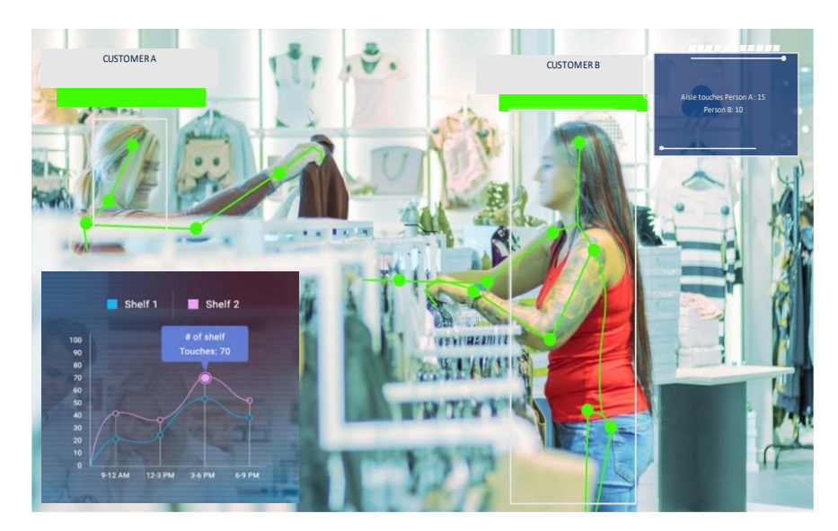
Figure 4. Product Engagement

Customer product interactions can now be measured to show product engagement. Deep North software can derive this information from the combination of demographic, age, gender, sentiment and repeat vs unique customers. Which is key to measure the level of interest in brands and products.