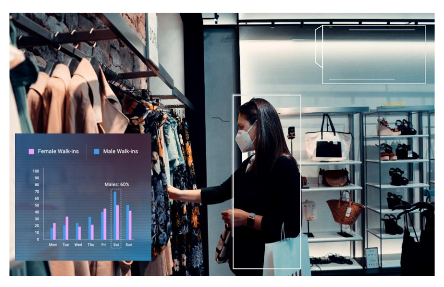
Figure 2. Zone Analytics

Retailers always try to optimize their shelf space and try to identify customer traction in different store sections. Deep North solution collects store zone footfall, occupancy, dwell time, and can alert at high zone occupancy. Zone analytics can help retailers understand customer behaviors and pattern in different store sections. Retailers can then better assign associates based on those traffic zones.