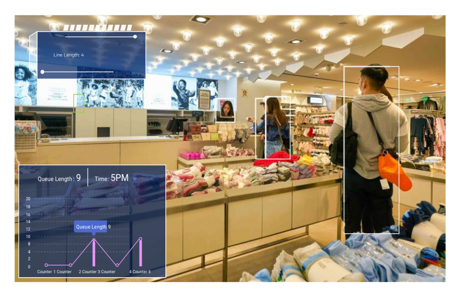
Figure 5. Prevent Line Abandonment

Line abandonment is a major concern for retailers. Queue length and wait time are major factors for a customer decision to purchase any item. Long wait time degrade the customer experience. Deep North application provides metrics such as line length/wait time, check out time. With line abandonment alerts, retailers can add additional cashiers to open, preventing revenue loss, and providing faster check out times.