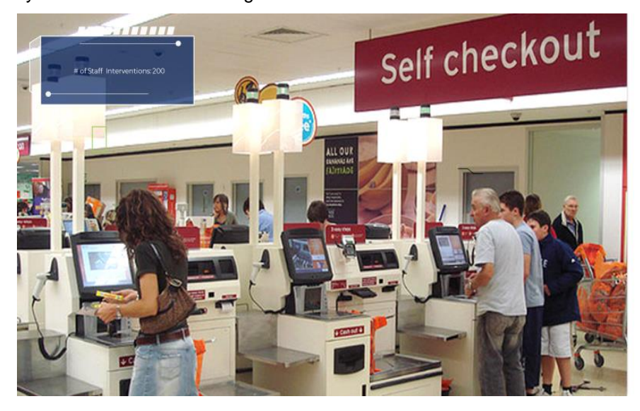
Figure 6. Checkout IQ

Checkout IQ Checkout IQ gives retailer's visibility into the number of items in customers basket vs scanned items. Deep North solution also captures matrices such as number of self-checkout customers per day, transaction time and can immediately alert when discrepancies between basket item vs scanned items occur. This improves retailers' profitability with reduction of shrinkage.