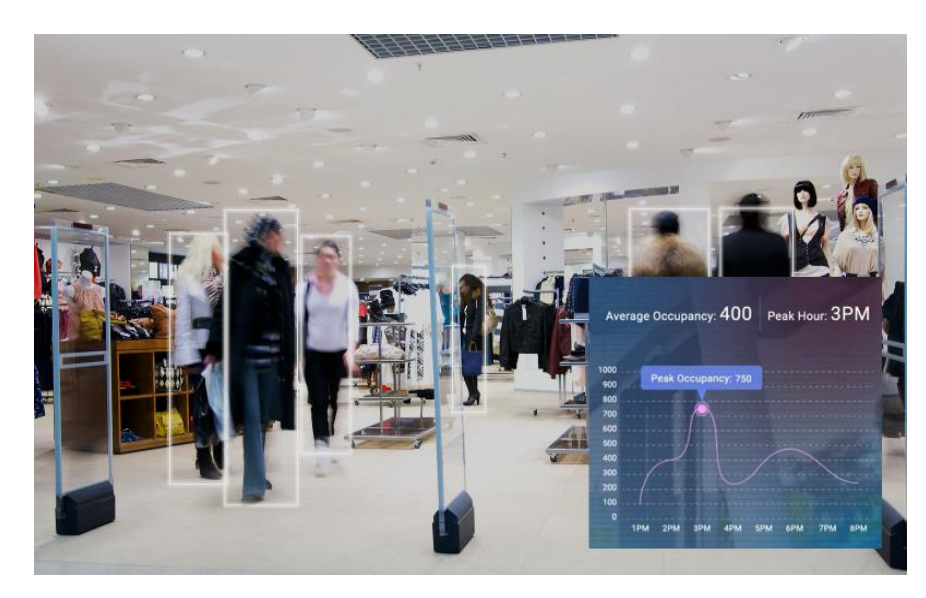
Figure 1. Foot fall and Demographics

The Deep North intelligent video analytics can detect customer traffic pattern and demographic in real time. Historically, it was done indirectly through surveys or keeping an employee to physically track the customers. The software captures multiple data points such as store exits, occupancy age/gender, repeat vs unique, and peak time. The result is that retailers get clear picture of male to female shopper ratio, as well as the impact of marketing campaigns on store footfall and store occupancy trends.