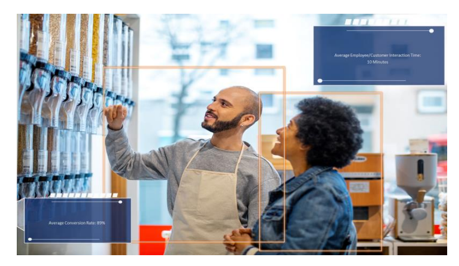
Figure 7. Employee Customer Interaction

Employee customer interaction plays a critical role in a customer journey. It has a heavy impact on sales. The Deep North software captures metrics such as length of interaction between customer and associate, staffing presence and POS conversion. This helps retailers by tracking order time, sales conversion percentage and check-out time on an individual associate basis. Hence, it increases sales with ideal employee/customer interaction times.