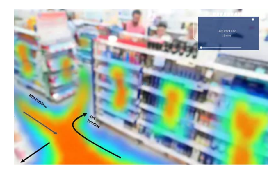
Figure 3. Customer Journey

Understanding of customer journey is a critical part of a retail setting, it consists of the dominant path which a customer follows, heat mapping and dwell time. Deep North provides these insights in real-time that can assist retailers to plan store layout and merchandising in an optimized fashion.