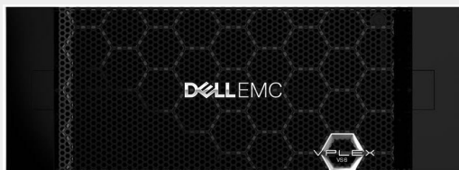
VPLEX All Flash

VPLEX™ delivers continuous data availability, transparent data mobility and non-disruptive data migration for mission-critical applications