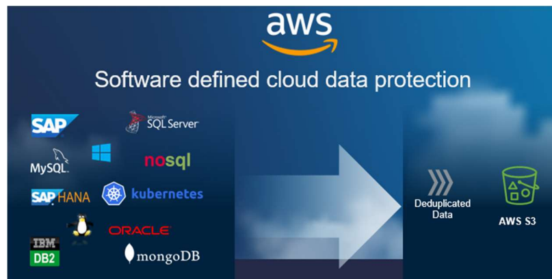
Multicloud data protection for AWS

Dell cloud data protection solutions help drive operational efficiency, resiliency and scalability while reducing the total cost of ownership with up to 77% more cost-effective cloud data protection in AWS than the competition. 1