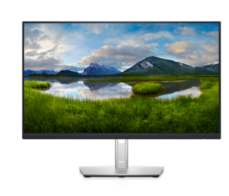
Dell 24 Monitor - P2422H

Stay productive no matter where you work with this sleek 23.5" FHD monitor with ComfortView Plus.