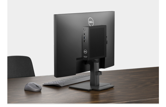
OptiPlex 3000 Thin Client

The OptiPlex 3000 Thin Client delivers a quiet, durable computing experience and makes it easier for you to multi-task.