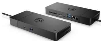
DELL DOCK | WD19S

Work at full speed with Dell's powerful USB-C dock. Charge your system faster, support up to three displays and connect to your peripherals via a single cable.