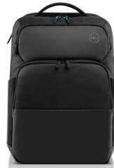
DELL PRO SLIM BACKPACK 15 | PO1520PS

Featuring the widest variety of ports available, the compact 7-in-1 Dell USB-C Mobile Adapter offers seamless connectivity to various devices like monitors, projectors, headsets, keyboard, mouse, flash drives and other accessories.