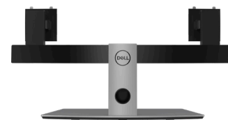
DELL DUAL MONITOR STAND | MDS19

Hear every word clearly on your next call with the Dell Pro Stereo Headset, optimized to provide in-person call quality.