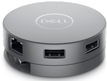
DELL USB-C MOBILE ADAPTER | DA310

Featuring the widest variety of ports available, the compact 7-in-1 Dell USB-C Mobile Adapter offers seamless connectivity to various devices like monitors, projectors, headsets, keyboard, mouse, flash drives and other accessories.