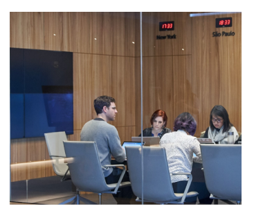
Count on enterprisegrade security, quality, and privacy