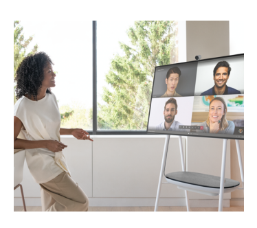
Keep everyone engaged with interactive experiences