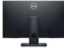
Back view - Cable management slot

Easily adjust the panel to your preferred viewing position.