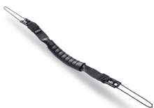
Flexible Handle - SWT-FLXHD

Mount your tablet instantly to any metal surface with a powerful VESA magnetic backplate.