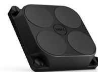
Magnetic Mount - SWT-MAGMO

Ergonomic strap that attaches to the corner tethers of your tablet for enhanced portability.