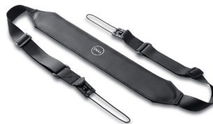
Shoulder Strap - SWT-SHSTP

Reversible, removable handle with angled design makes it easy to reach the controls in the tablet's configurable bay.