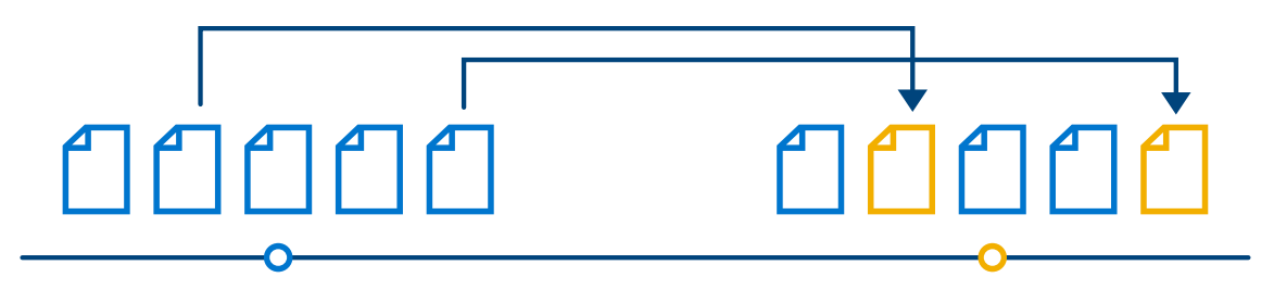
Data Recovery from immutable snapshots in the Cyber vault

For data recovery you can utilize the immutable snapshots in the cyber vault to granularly restore data to last clean version of it. Not all vault copies are the same. A cyber vault copy on PowerScale enables unmatched RPO of a few hours for a Petabyte of data, something that can take weeks with a typical Object store.